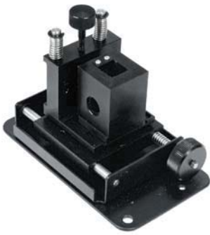
Cat. No. 18900337 Micro Cell holder