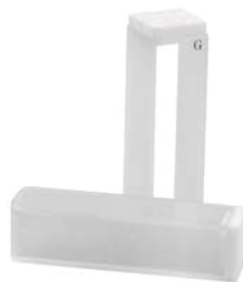
Square cuvettes glass/quartz 1-5mm/10-100mm