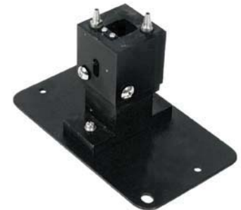
Cat. No. 18900335 10mm water-jacketed 1 cell holder (for SP-V1100 & SP-UV1100)