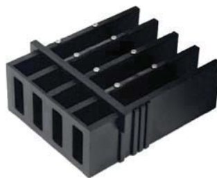
Cat. No. 18900333 4-cell holder for up to 100mm squ.cuvette