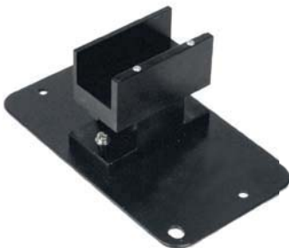
Cat. No. 18900334 cylindrical cell holder(ø16mm)