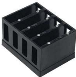
Cat. No. 18900332 4-cell holder for 10mm to 50mm squ. cuvette