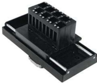
Cat. No. 18900340 8-position auto cell changer (for SP-V1100&SP-UV1100)