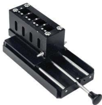
Cat. No. 18900336 10mm water-jacketed 4-cell holder (for SP-V1100 & SP-UV1100)