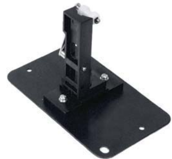
Cat. No. 18900338 Test tube holder(ø8-ø22mm)