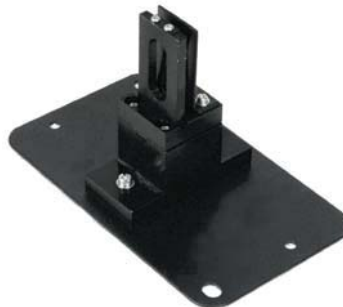
Cat. No. 18900339 solid sample holder (ø1.5-3mmø 1 position)