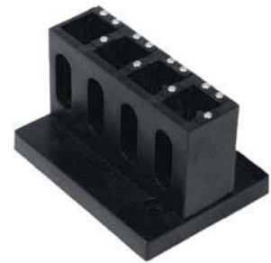
Cat. No. 18900331 4-cell holder for 10mm squ.cuvette